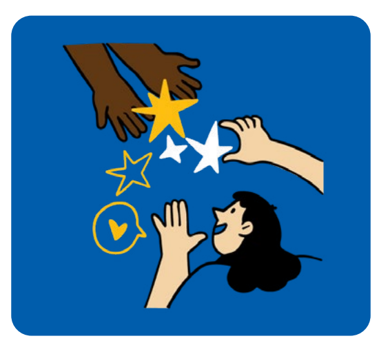
With Entire School Community Share Information

With School Staff Trainings, Coordination